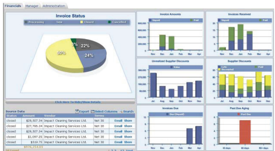
Converga Analytics for AP - Executive Dashboard

Converga Analytics provides a consolidated view of your company's total AP liabilities in real-time. Regardless of how many locations, GL systems or ERPs you have running, Analytics provides the key performance indicators for financial executives to make fact-based decisions on how to best manage cash, suppliers and AP workload. Fully integrated with Converga PAP, Analytics allows you to make real-time decisions and instruct Converga PAP's Entry Channel Rules Engine to execute according to your fluctuating cash position.