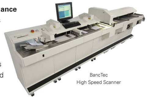
BancTec High Speed Scanner

Keeping ahead of technological innovations that give you faster access to information, improve business processes and enhance your ability to service customers can be challenging for individual companies. This is why Converga offers clients fully automated e-business solutions to reduce physical paper volumes through its network of Converga Technology Centres (CTC's). The CTC's are commercial grade data centres housing tier-1 technical hardware and communications infrastructure that host leading, robust enterprise-level document and information processing applications. We process in excess of 100 million documents annually on behalf of our clients.